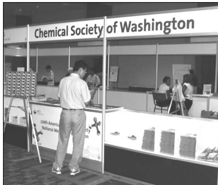
The CSW Hospitality booth was a valuable source of National Meeting information for many attendees.

Don't forget, every new student member you recruit also applies toward your local section commission claim and the 2009 ACS President's Challenge. (Continued, page 10)