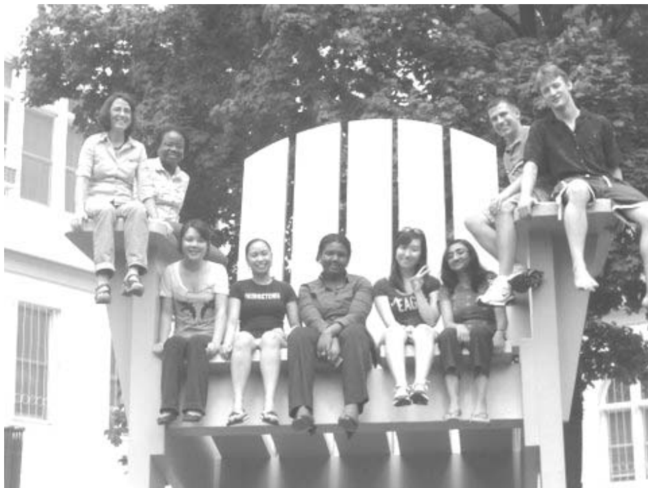
Project SEED students mug for the camera on The Big Green Chair on the Duke Ellington School grounds near Georgetown University.

Visit CSW on the web at: www.csw-acs.org